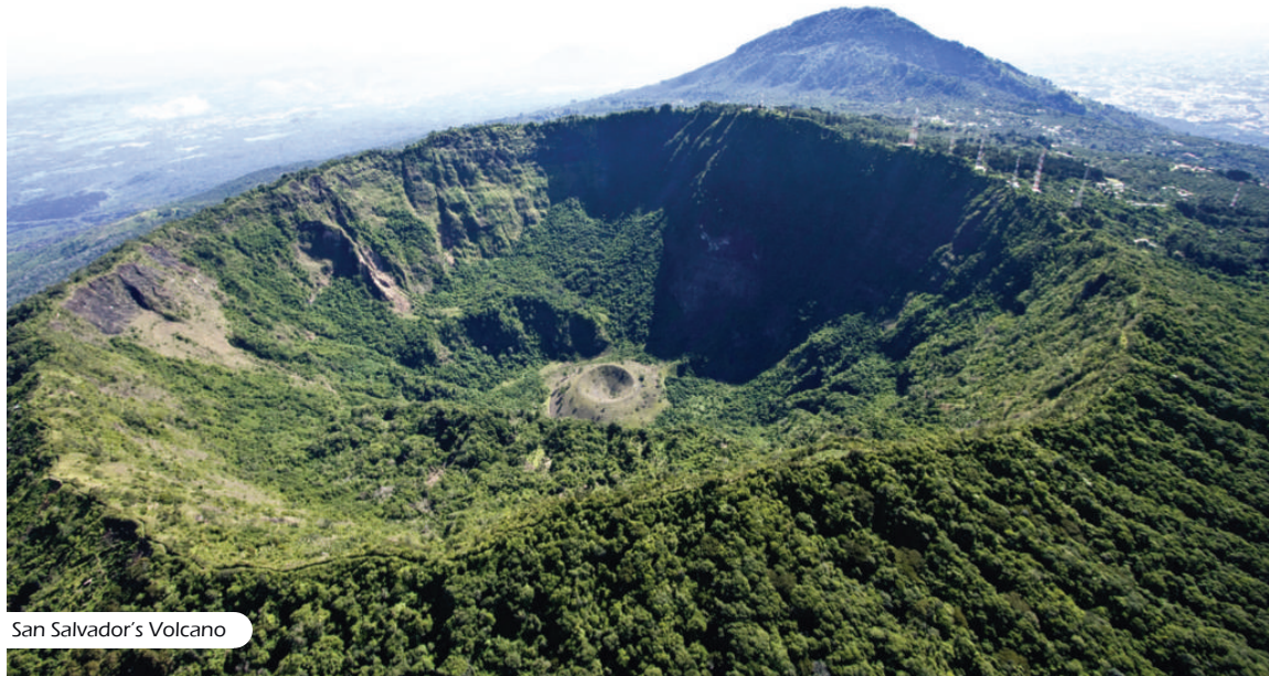
San Salvador's Volcano