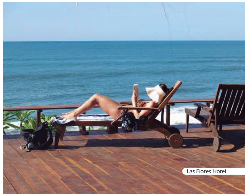
Las Flores Hotel