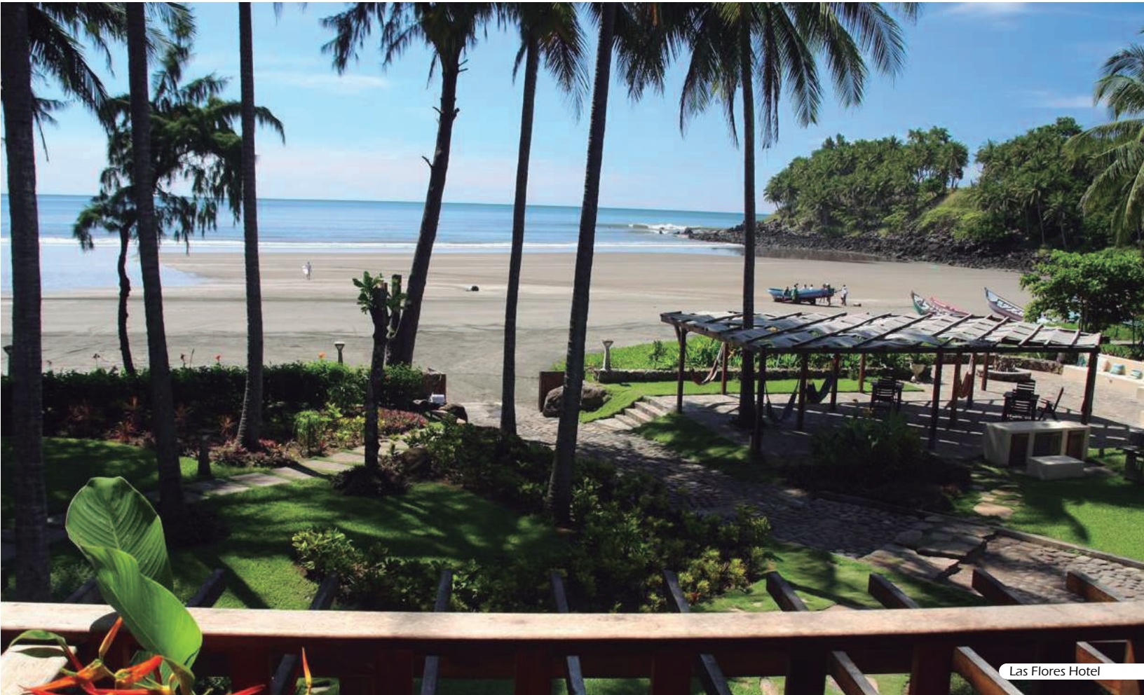
Las Flores Hotel