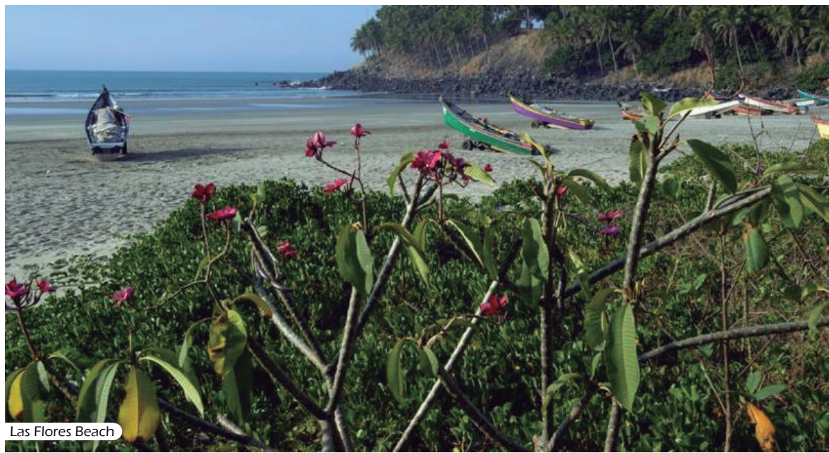
Las Flores Beach