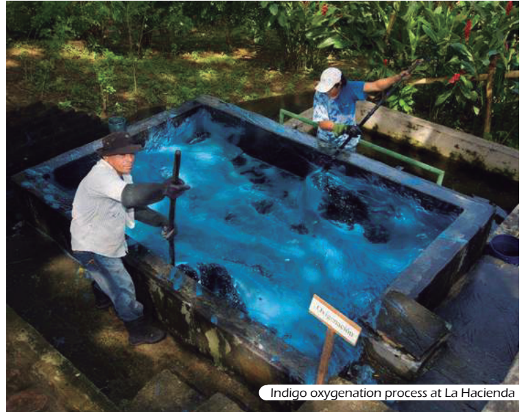
Indigo oxygenation process at La Hacienda