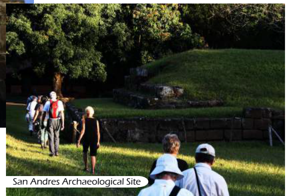
San Andres Archaeological Site