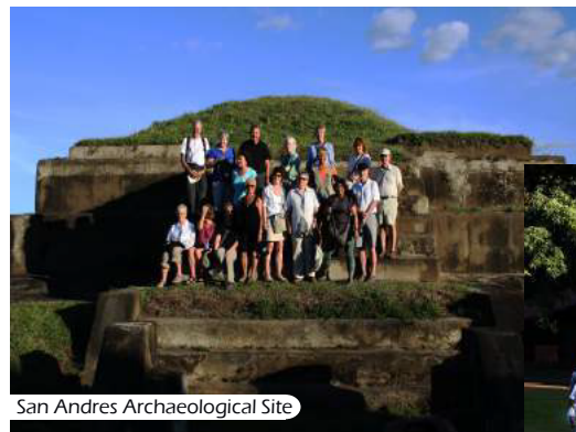
San Andres Archaeological Site

Return to airport for connecting flight.