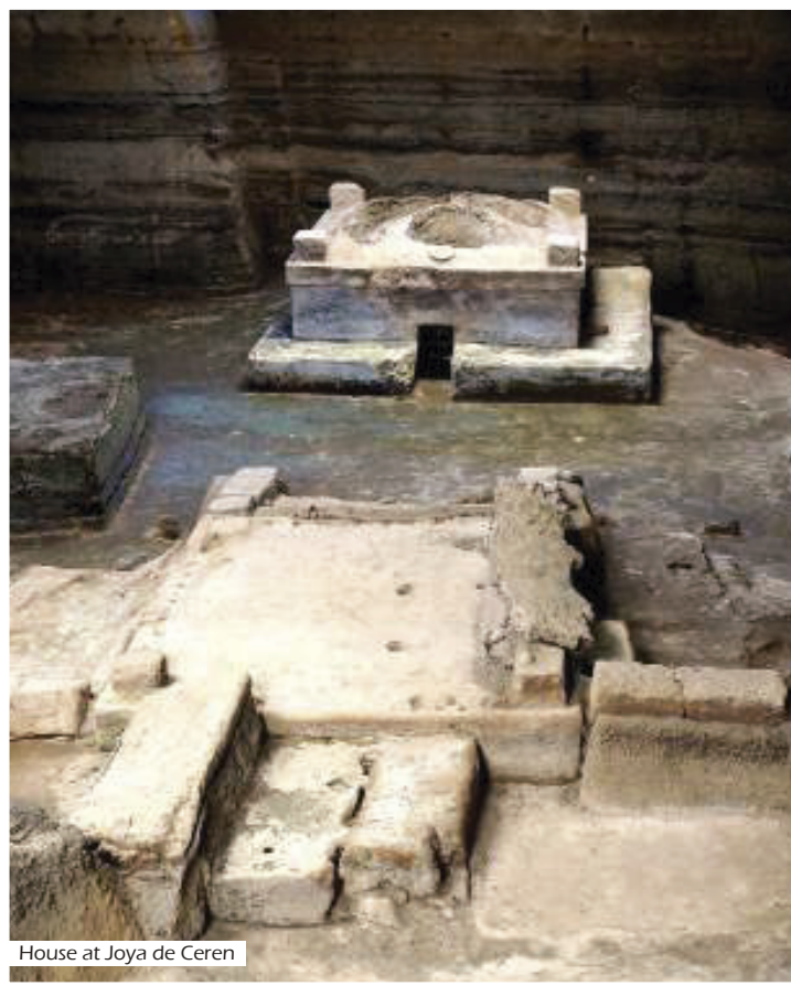
House at Joya de Cerén