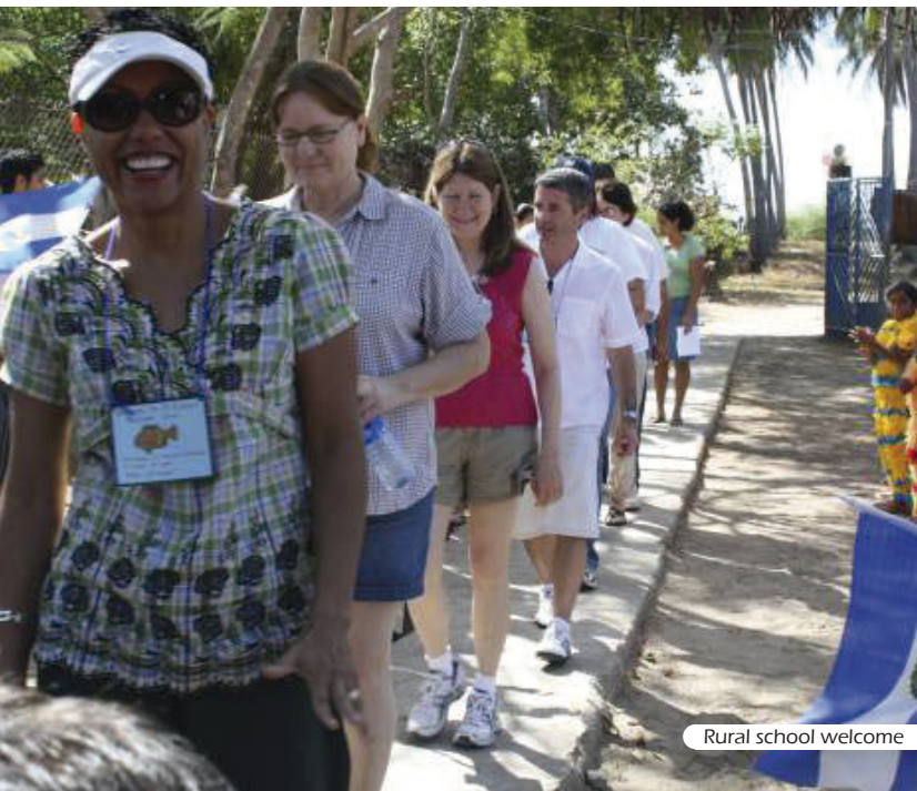
Rural school welcome