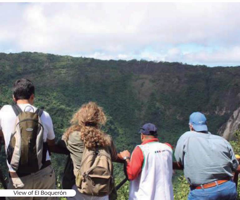
View of El Boquerón