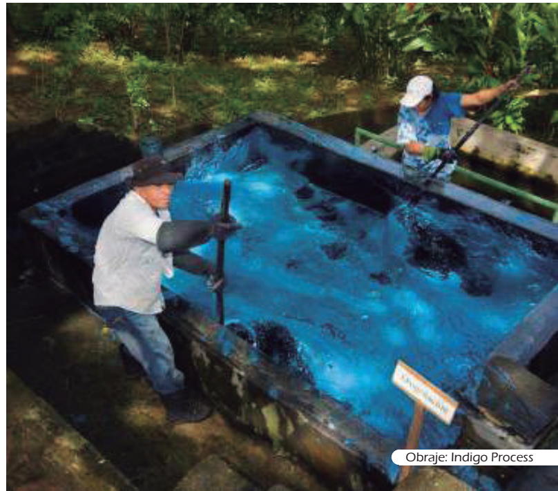
Obraje: Indigo Process