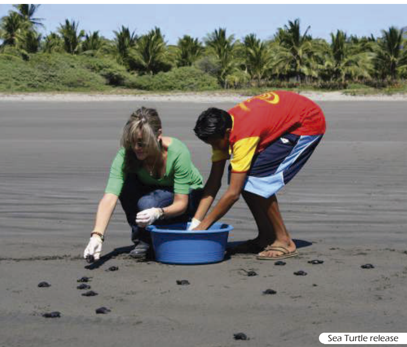
Sea Turtle release

Afternoon, return to San Salvador. Lodging in San Salvador