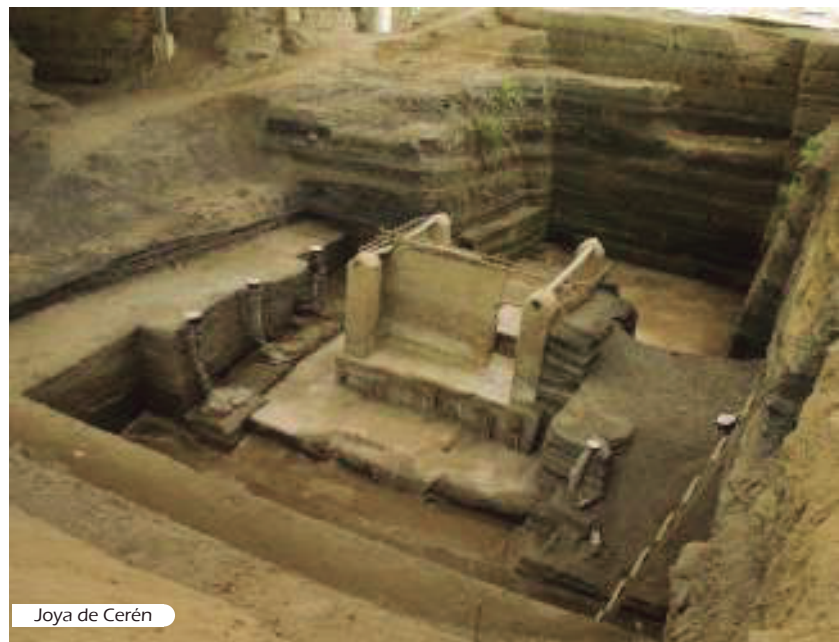
Joya de Cerén