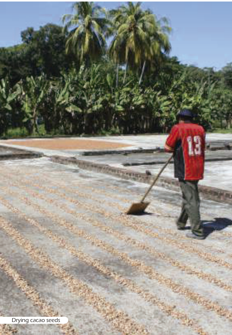
Drying cacao seeds