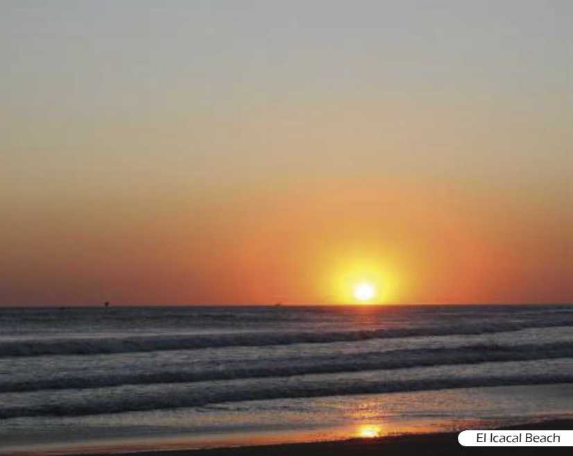
El Icacal Beach