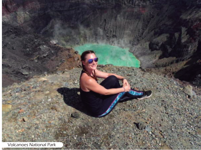
Volcanoes National Park