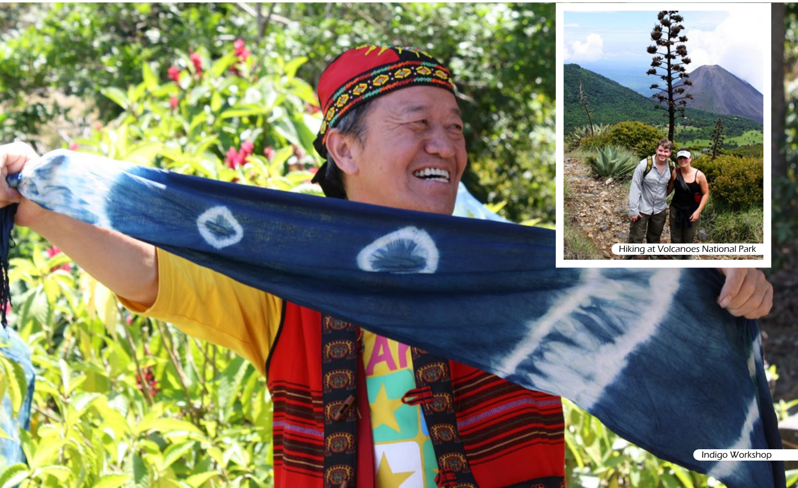
Hiking at Volcanoes National Park

We will visit a coffee plantation and if the tour takes place within coffee season (DEC-MAR), travelers will be able to collect coffee themselves along with the locals. After this experience, a guided tour will explain each step of the coffee process. Travelers will be able to buy coffee products and crafts as souvenirs.