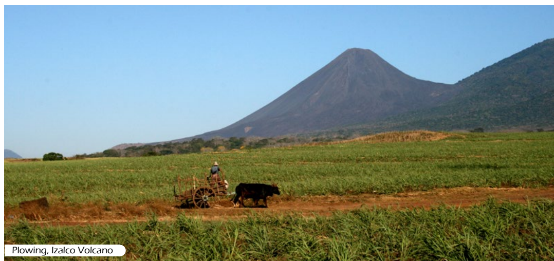
Plowing, Izalco Volcano